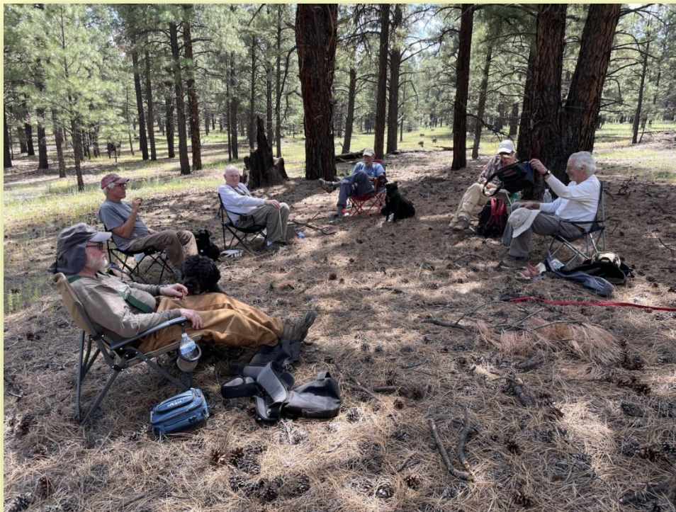
Lunch at Landfill Road project

Website address: http://www.fs.usda.gov/coconino/