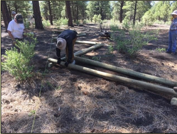
More photos from Cinder Hills