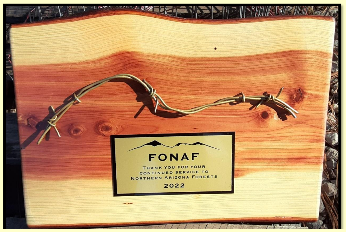
Gold Barbed Wire Award

The late afternoon event did not go without some drama. The original pizza party was scheduled for Monday October 3<sup>rd</sup> at one of the camp sites in Camp Elden at